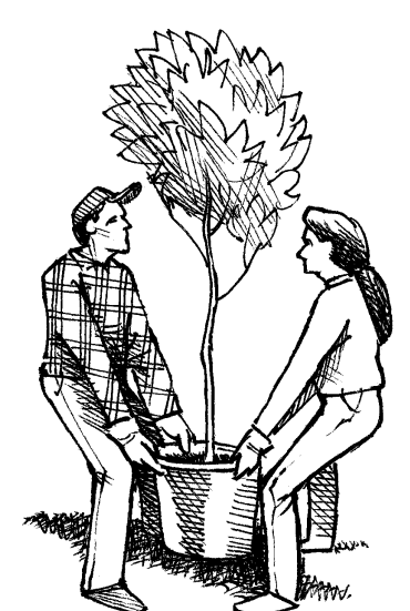
Ask for help if an object is heavier than you can lift alone.

Note to trainer: Take time to answer trainees' questions. Then review the Lifting Awkward Loads Do's and Don'ts.